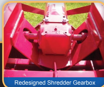
Redesigned Shredder Gearbox